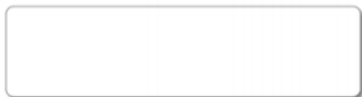
← Tag polarization →

Ideal installation conditions are +20°C (+68°F) / 50% RH. For exceptional conditions, please contact Confidex. Adhesive of the label will provide best adhesion in 24 hours after the installation. Bond strength can be improved with firm application pressure. Always clean and dry the surface for obtaining the maximum bond strength. Avoid touching the background adhesive.